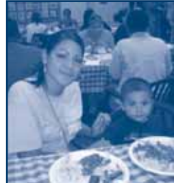
Alumni members and staff ( above ) enjoy celebrating National Recovery Month at the LaPrada campus. Alumni members ( left ) share the celebration with family and friends.

Fourteen members of the Aftercare Program attended the "Singles in Sobriety" event held annually in Ardmore, Oklahoma. Funds from Recovery Circles Foundation were used to provide transportation, meals and lodging so that participants could experience "fun in sobriety" and participate in programs like speaker jams, meditations by the lake and, as the staff member who accompanied the ladies on the trip reported, "awesome networking!"