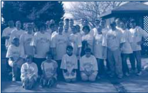
Saville, Dodgen & Company volunteers (above, right and below)