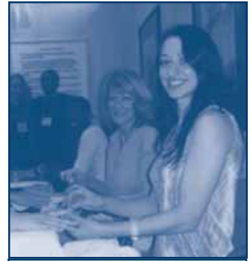
Volunteers from Art for Communities Sake give manicures to the Adult Women clients.

Volunteers from Saville, Dodgen & Company returned to Nexus for another painting project.