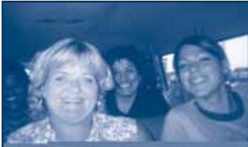
Alumni members travel to Oklahoma.

In September the aftercare and alumni programs worked together to celebrate National Recovery Month with a picnic for current Nexus clients. More than 25 aftercare and alumni participants helped to decorate, serve lunch and share their stories with residential and outpatient clients. The next day in the front hallway a client, who was leaving, told her friend good-bye adding, "I'll see you in Aftercare!" Obviously she had been inspired by the event.