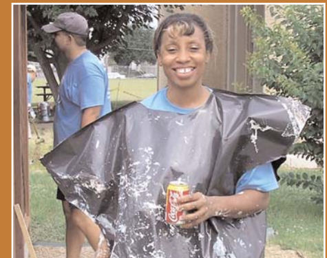
A volunteer tries to protect herself from paint.