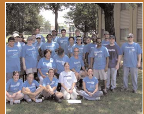
Many thanks to all the wonderful Deloitte volunteers.