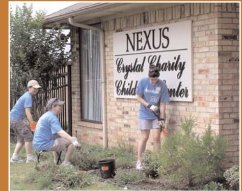
Deloitte volunteers plant flowers in front of the Crystal Charity Children's Center.