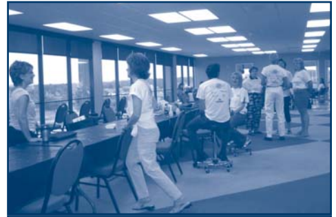
Stylists prepare for a busy day.