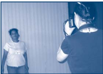
Before and after pictures capture the transformation.

And it was! More than 40 volunteers gathered in the Park Central II building recently purchased by Watermark. They haven't started the renovation project yet, so for one day only portions of the building were transformed into a mini-spa just for the residents of Nexus. Temporary sinks were installed in what was once a kitchen for the building and Nexus clients had the opportunity to have their hair cut, colored and styled; receive manicures, facials, massages and make-up; take a self-defense class; and meet with health and nutrition specialists.