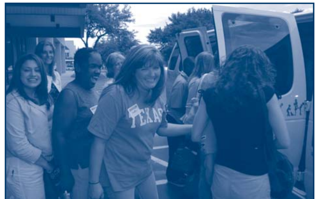
Clients head back to Nexus thankful for the generosity of so many volunteers.