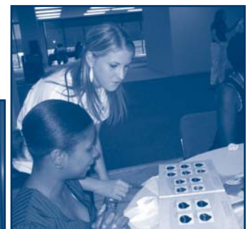
Volunteers help with color selection.