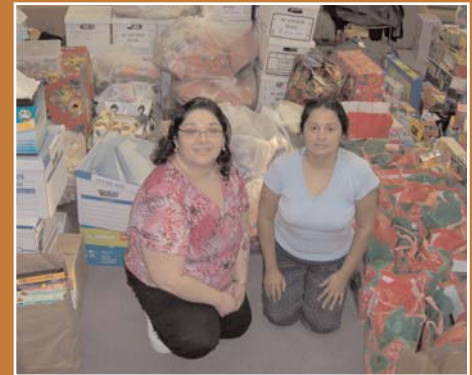
Volunteers from HUB Financial Services deliver holiday gifts and food items for residential and outpatient clients.