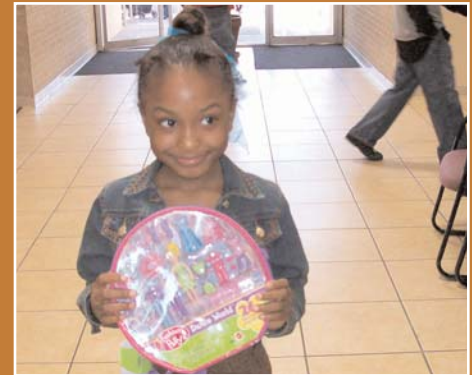
A child in residence with her mother is happy to receive a Christmas gift from Gospel Tabernacle Church volunteers.